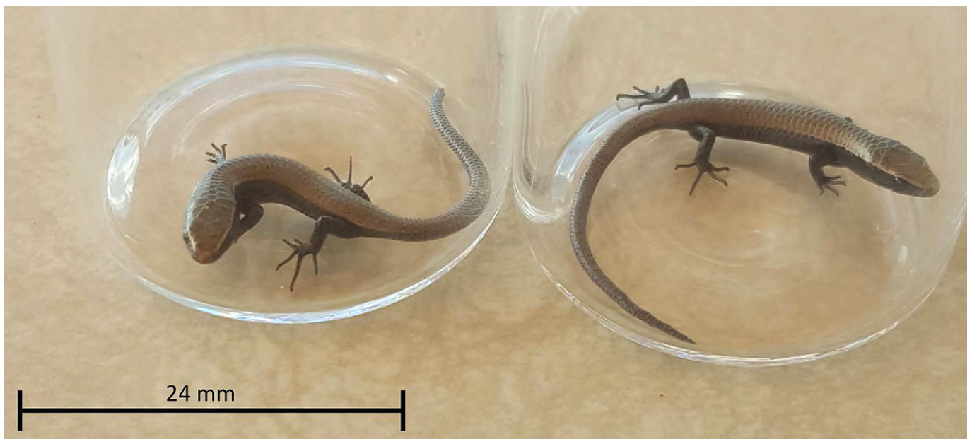
Figure 3. Hatchling Gymnophthalmus underwoodi specimens collected for analysis.

Genomic DNA was extracted from a small piece of tail from specimen #6432 preserved in 95% ethanol using a DNeasy Blood and Tissue Kit (Qiagen, Inc.). Purified DNA was then PCR amplified at 1 mitochondrial (16S) and 1 nuclear ( c-mos ) locus. A 500 base pair fragment of 16S rDNA was generated using the primers 16Sar and 16Sbr (PALUMBI et al. 1991, GenBank accession number KX66265) and a 390 base pair fragment of the nuclear gene c-mos was generated using the primers G73d and G74d (SAINT et al. 1998, GenBank accession number KX66266). Forward and reverse sequences were aligned and edited in BioEdit (HALL 1999) and MEGA 6 (TAMURA et al.