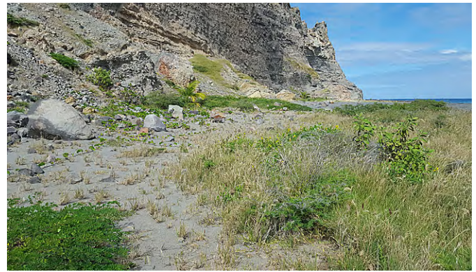
Figure 2. Beach habitat south of Bottomless Ghaut where Gymnophthalmus underwoodi specimens were collected.

ment of the Environment, Montserrat and Bard College at Simon's Rock (with a special permit drafted to allow transport of specimens to the United States), 2 lizards were collected by hand on 6 January 2016 and 14 January 2016 on the east side of the island south of Bottomless Ghaut among beachside vegeta-